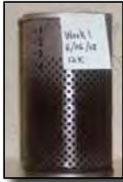
Fuel filter casing before CarbonTreat™ Premium.

Specifically designed for 2010+ EPA engines.