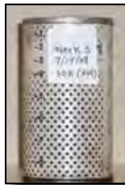
Same fuel filter casing after 5 weeks with CarbonTreat™ Premium in the fuel system.